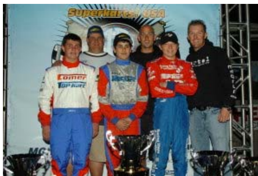
Team Top Kart USA scored four victories last year at the SKUSA SuperNationals

After winning the 2009 Super Nationals in Tag Sr & Tag Jr & winning the S5 Shifter for the 3rd straight year, the team is preparing again to try to achieve success for this year's event. This year Super Nationals team is comprised of new, old & veteran talent.