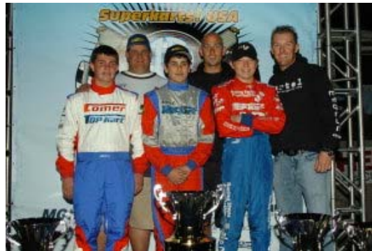
Team Top Kart USA scored four victories last year at the SKUSA SuperNationals

After winning the 2009 Super Nationals in Tag Sr & Tag Jr & winning the S5 Shifter for the 3rd straight year, the team is preparing again to try to achieve success for this year's event. This year Super Nationals team is comprised of new, old & veteran talent.